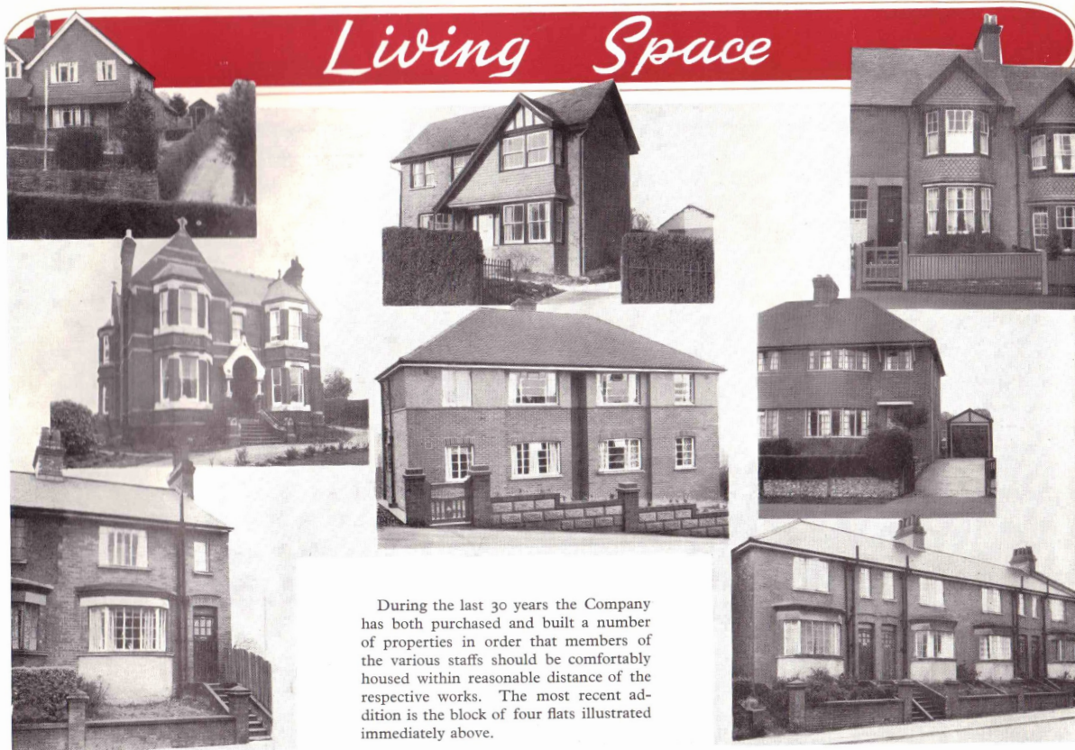
During the last 30 years the Company has both purchased and built a number of properties in order that members of the various staffs should be comfortably housed within reasonable distance of the respective works. The most recent addition is the block of four flats illustrated immediately above.