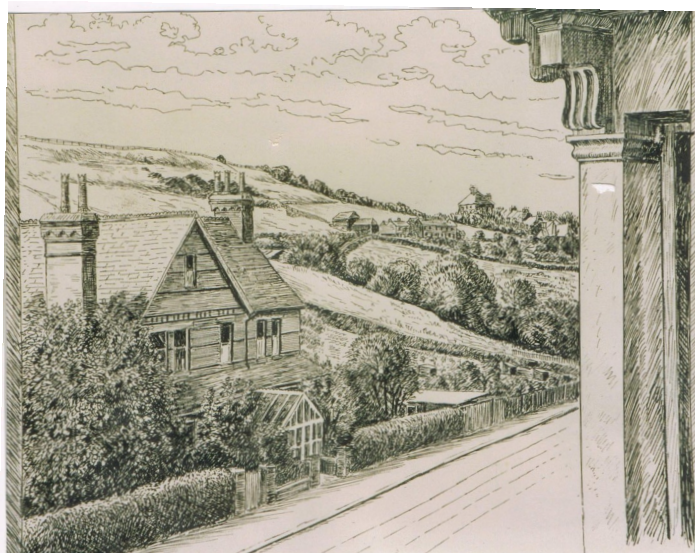
Below left: "The view from one of our upstairs bay windows." Painted from 155 Harold Road.