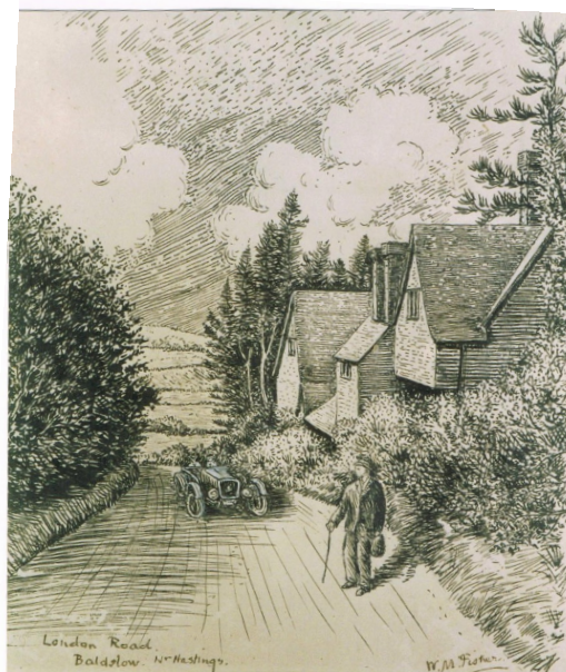
Above: "The London Road " ie the A21